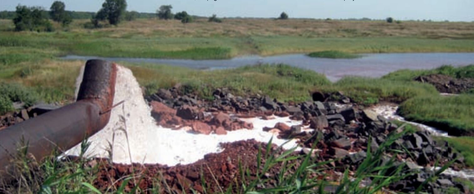
Mine dewatering

Locations with significant snowfall, particularly periglacial regions, can present an extra challenge during the spring freshet as the volume of waste water can increase by an order of magnitude during a relatively short time. Similar issues can arise for projects in ►