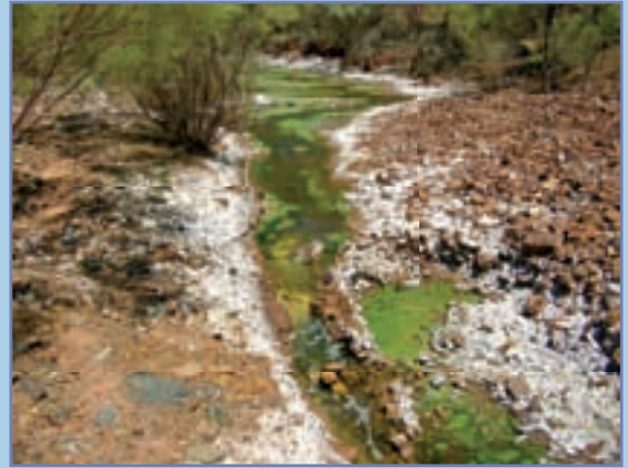
Acid mine drainage occurs naturally at about 70% of base metal mines

Primary sources of waste water on mine sites include: dewatering operations to lower groundwater levels and prevent the flooding of open pits or underground workings; water pumped from open pits or underground workings that comes into contact with exposed surfaces; seepage and run-off from waste rock facilities; seepage and run-off from ore stockpiles and ore in transit; seepage or uncontrolled