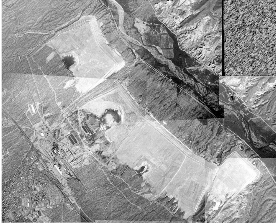
Photo 1 San Manuel Plant Site Operations (Aerial view pre-closure)

BHP worked within the Pinal County Comprehensive Plan (2005) as well as local economic development agencies to identify appropriate land use options and opportunities for the Plant Site. In areas of former heavy industrial activity, BHP collaborated with the Arizona Department of Environmental Quality to establish appropriate soil remediation levels for site remediation. The operations are shown on Photo 1.